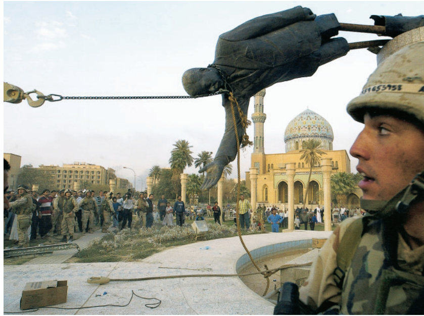
▲ In central Baghdad, a U.S. Marine watches as a statue of Saddam Hussein is pulled down.

Ethnic and religious conflicts have often led to terrible violence. People caught in these conflicts sometimes suffered torture, or massacres of their whole towns or villages. The Kurds of southwest Asia have been the victims of such violence. For decades, Kurds have wanted their own separate country. But their traditional lands cross the borders of three nations—Turkey, Iran, and Iraq. In the past, the Turks responded to Kurdish nationalism by forbidding Kurds to speak their native language. The Iranians also persecuted the Kurds, attacking them over religious issues. In the late 1980s, the Iraqis dropped poison gas on the Kurds, killing 5,000. Several international organizations, including the UN, are working to end the human rights abuses inflicted upon the Kurds.